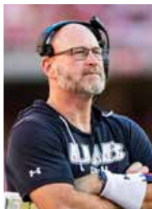
SPECIAL GUEST: TRENT DILFER Head Coach UAB Blazers

SALVATION | Pray that the Lord would be glorified through Team Night, and that people would come to saving faith in Jesus Christ. Pray that students would hear the gospel and respond in faith to Christ.